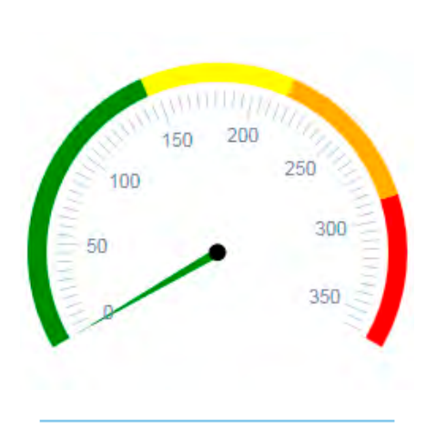
Systems In Alert (Live)